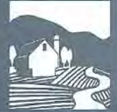
Figure 1-11a. Rockbridge County